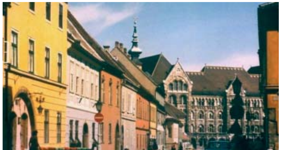
Budapest - Buda castle