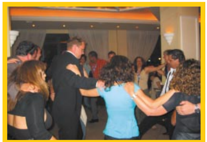
Greek culture in practice was part of the social program.